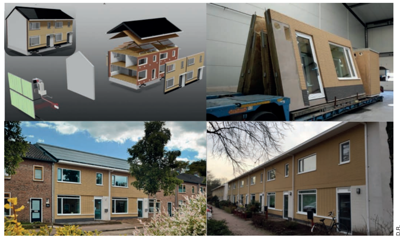
The building blocks of the technical solution for row houses as used in one of the early models. The Energiesprong philosophy does not only apply to external wall insulation. It is about developing industrialized solutions with an energy performance guarantee that are quick to install. This could also include (partial) internal insulation solutions.

the prospect of substantial demand and suitable supply becomes apparent, a wider range of finance providers will be able to evaluate this new proposition to offer tailored financial products and governments will be able to create the an enabling regulatory environment.