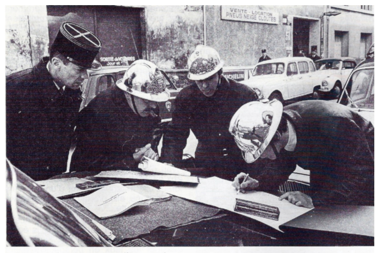
Le directeur des secours attentif au croquis.