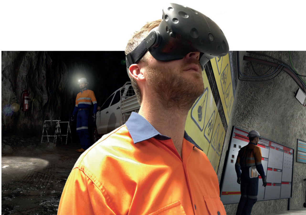
Photo 5: WorksiteVR Quest from Immersive Technologies a tool designed for the mining industry that allows users to virtually experience and engage safely in worksite environments. It assists its users in understanding safety hazards, procedures and emergency situations in order to make mines safer and more profitable.