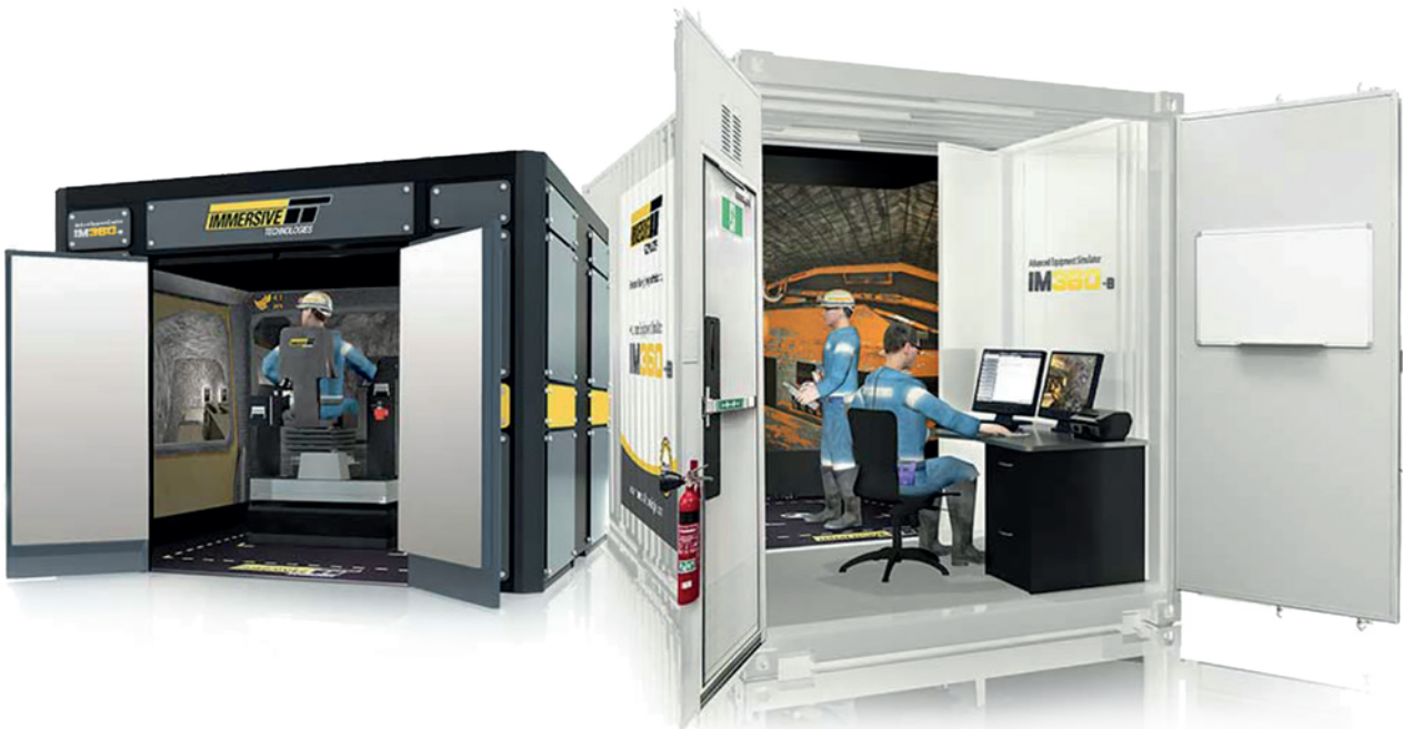
Photo 2: The IM360 from Immersive Technologies is built specifically for underground mining with the flexibility to train on surface mining environments. It delivers cutting edge technologies in a lower cost high fidelity platform.

With over 100,000 operator training sessions analyzed we know that less than 50% of experienced operators can recall the procedure to respond to an emergency machine failure. Immersive Technologies has proven to deliver over 90% pass rates using their simulation training solutions. Below are two examples of reported safety training improvements.