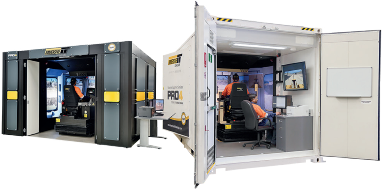
Photo 1: The PRO4 from Immersive Technologies is built specifically for surface mining. With a 3x Full HD frontal display plus a large integrated rear display, the PRO4 is the most advanced simulator platform on the market. It delivers realism at a level not previously seen by the mining industry. The PRO4 provides a robust, high fidelity platform for driving operator optimization and business improvement.

operator techniques they have a better understanding and knowledge of the real machine.