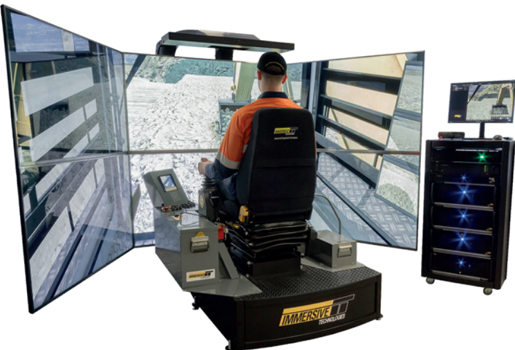
Photo 3: The LX6 from Immersive Technologies is a medium fidelity simulator platform perfect for machine and site familiarization, emergency response and compliance training.

An initial training needs analysis demonstrated an opportunity to improve haul truck spot times. Data analysis re-