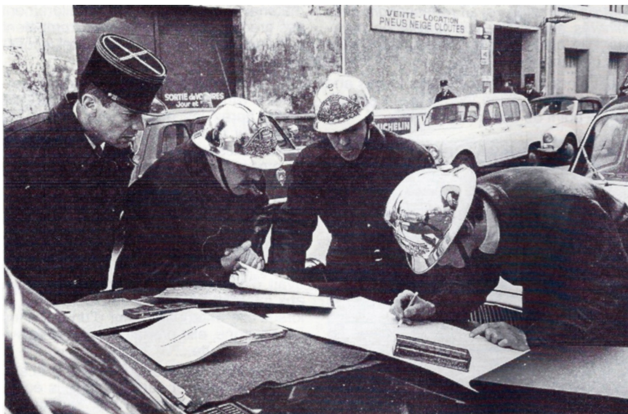
Le directeur des secours attentif au croquis.