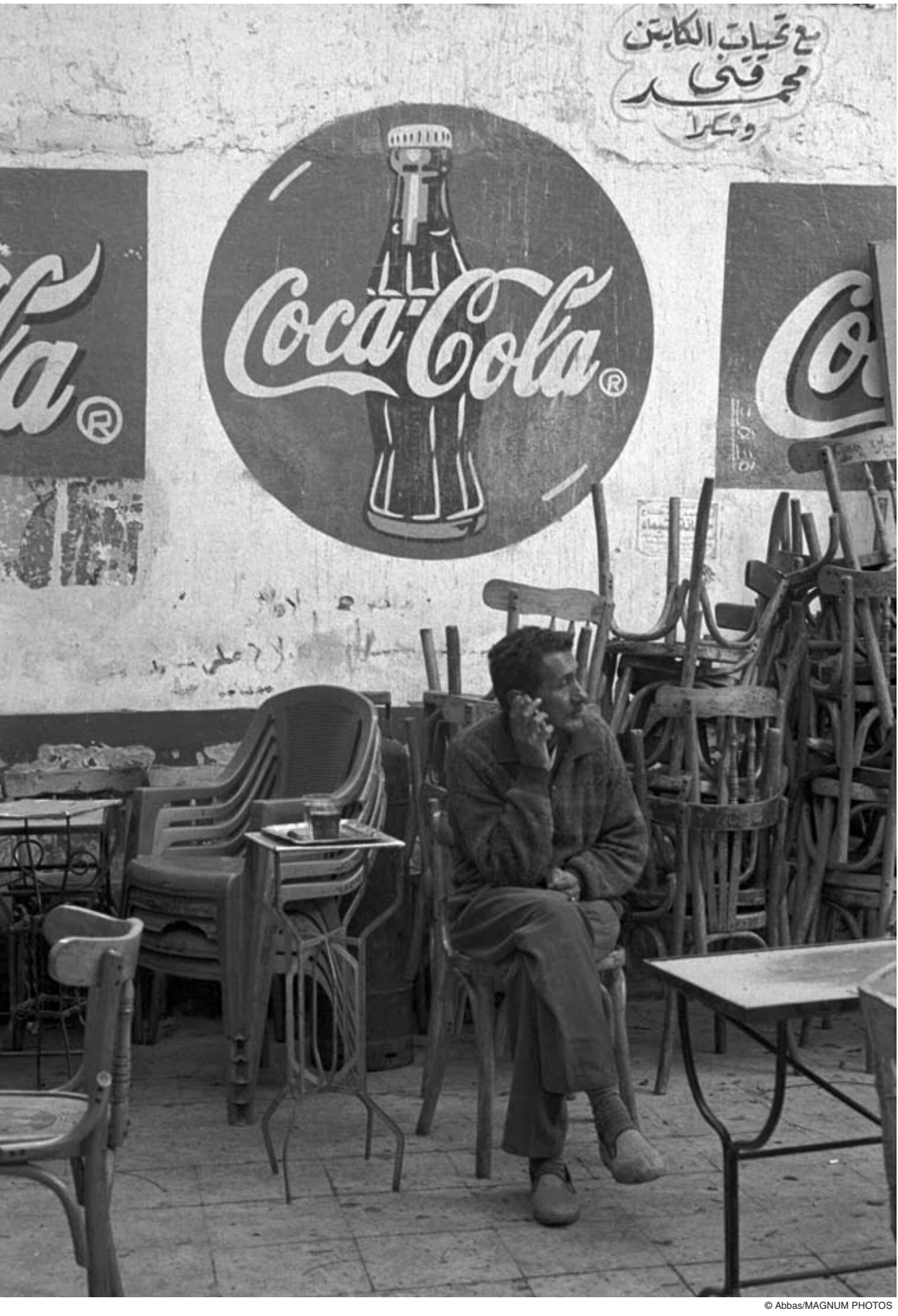
Mitchell has shown that international organizations are, in fact, helping to increase the economic and political hold of the United States.